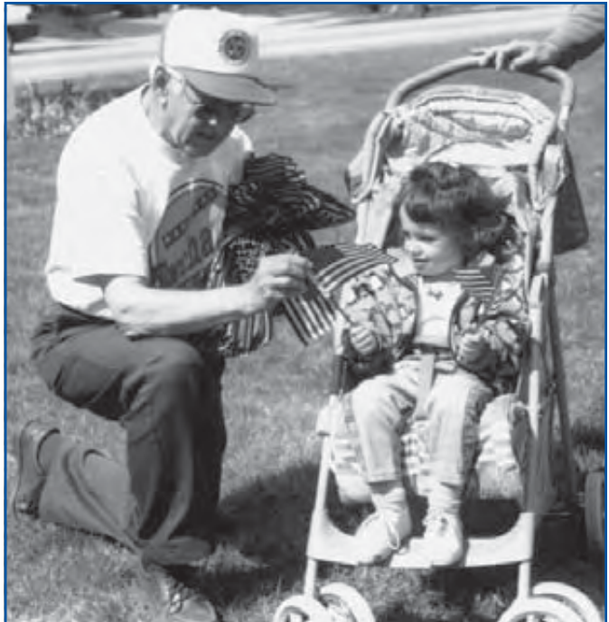
A member from the Exchange Club of Nashua, N.H., distributes American flags at the community's fair as part of Project GiveAKidAFlagToWave.

Another good idea is to make sure that the club gets proper credit for the flags in any parade program, newspaper, radio or television story. GiveAKidA-FlagToWave can not only become an institution in the community, but can become an attraction in itself, drawing more people to the events and adding extra color and excitement.