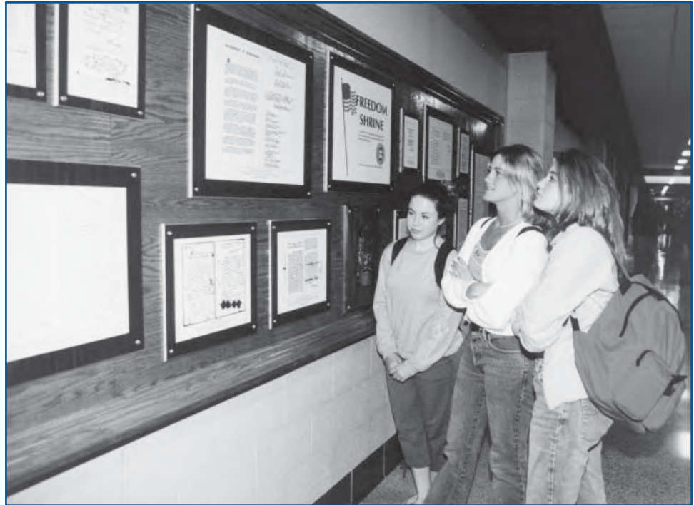
Students look over a Freedom Shrine dedicated by the Exchange Club of Gettysburg, PA. While Freedom Shrines can be dedicated or rededicated at any time of the year, Exchangites officially recognize May as Freedom Shrine Month.

“The heritage of the past is the seed that brings forth the harvest of the future.”